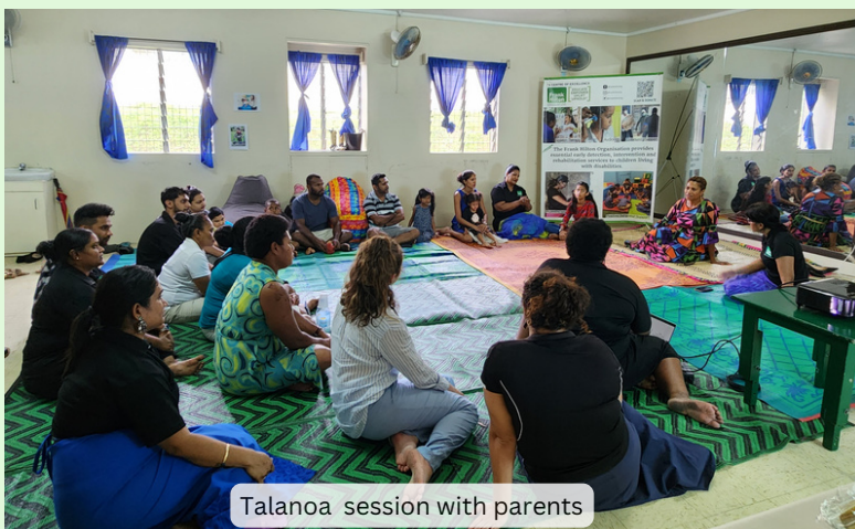
Talanoa session with parents